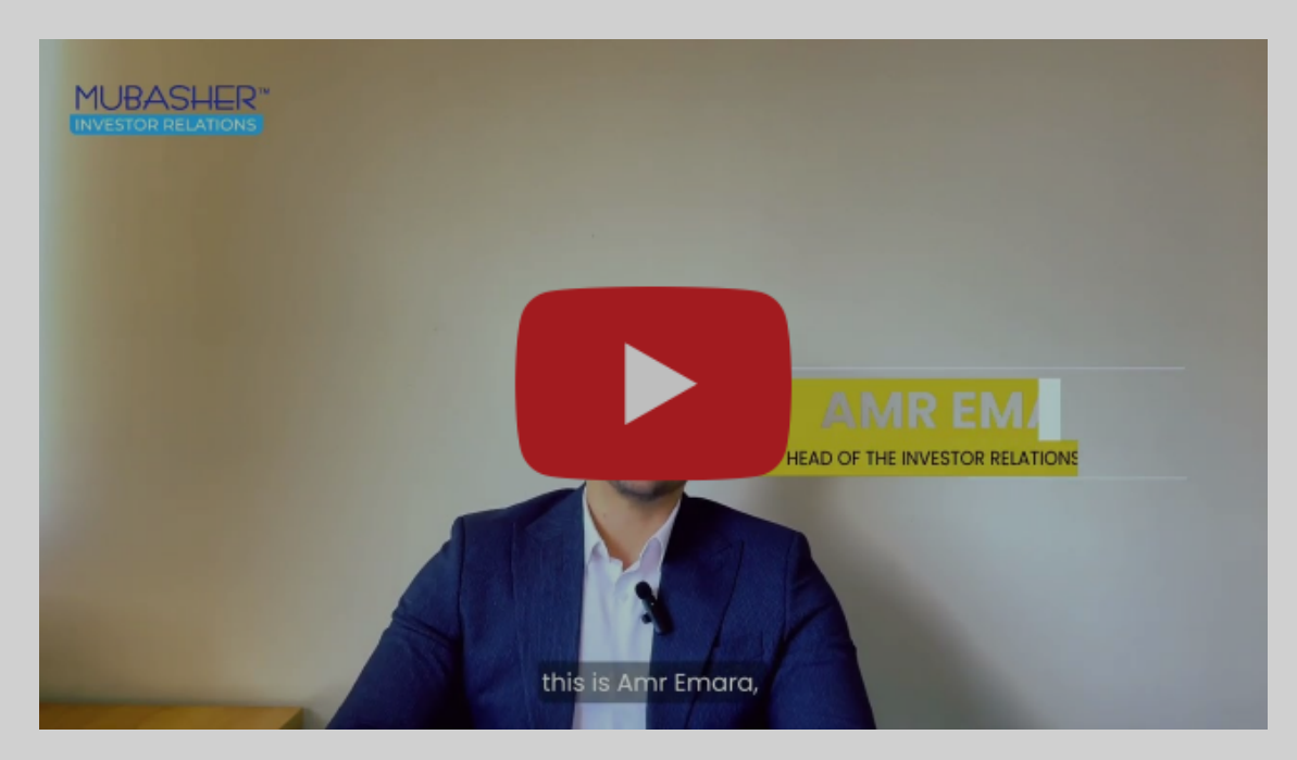
A message from GFM Mubasher