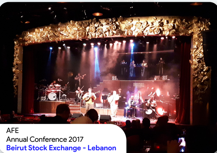
AFE Annual Conference 2017 Beirut Stock Exchange - Lebanon