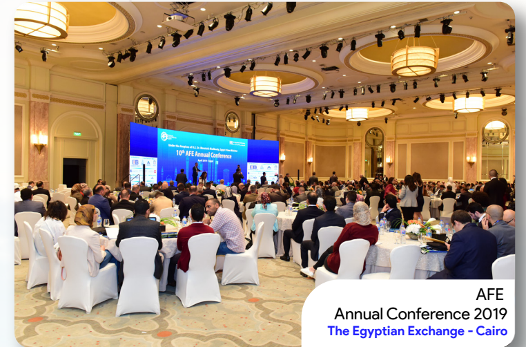
AFE Annual Conference 2019 The Egyptian Exchange - Cairo

We have covered several wide ranges of topics such as: The Future of Listings, SMEs, Artificial Intelligence, FinTech, RegTech, Technology and Fixed Income Securities, Impact investment, and CCPs.