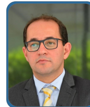
Ahmed Kouchouk Vice Minister Finance Fiscal Policies & Institutional Reform Egypt