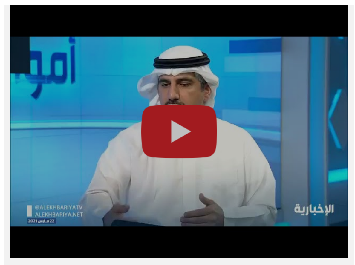
Saudi Capital Market Awards - MEIRA Interview

Congratulations to Al Rajhi Bank, STC and Almarai, winners of Tadawul's inaugural Saudi Capital Market Awards for best IR Programme category. For MEIRA, it has been an honour to take part in such an important event, and we look forward to celebrating more of your achievements in the near future.